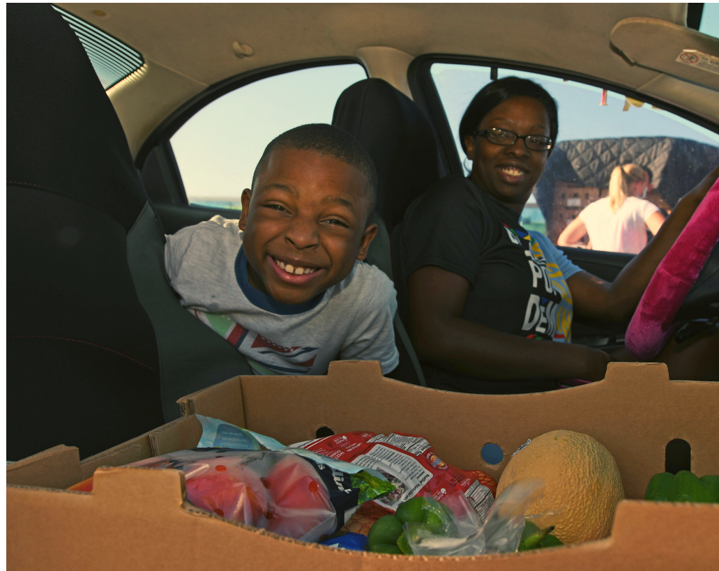
Feeding America and other food banks resorted to drive-through pickup in 2020 due to COVID-19.

Iquique U.S., LLC J.W. Couch Jones and Associates LLC Kent Warehouse & Labeling King County Employee Giving Program Kitsap Community Foundation LeGros Buchanan & Paul Leader Creek Fisheries Liberty Mutual Los Angeles Food Bank Lynden Inc. Marsh McClennon Matson, Inc. Mazzetta Company, LLC Medina Foundation MJ Murdock Charitable Trust Mundt MacGregor LLP National Fisheries Institute NOAA